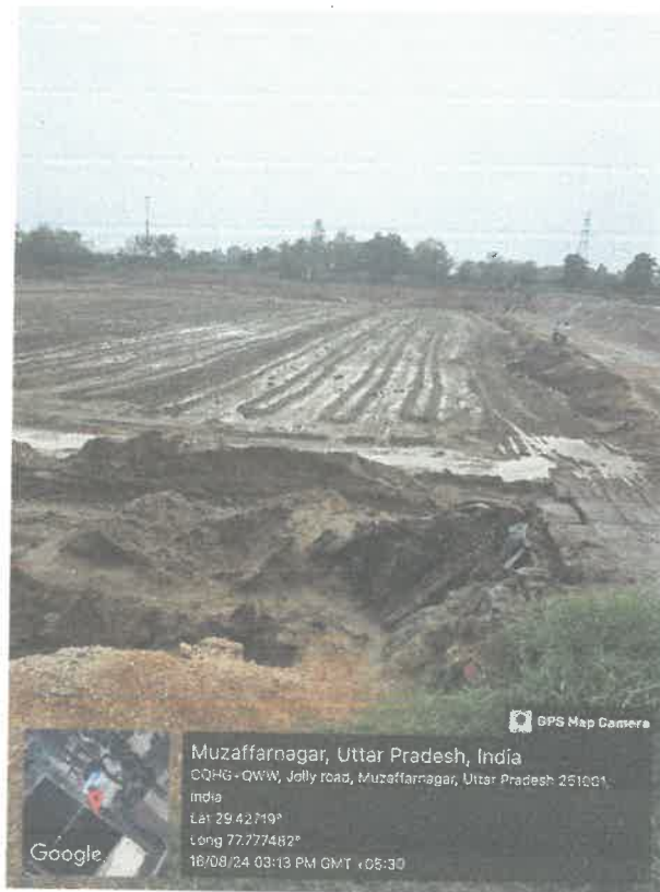
Dismantled Lagoon No. 2 (Cap. 14000 KLD)