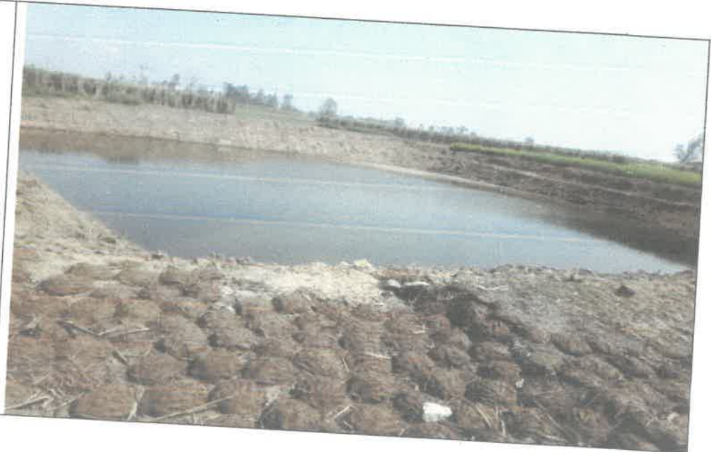
1. Bikki pond

Rejuvenation of Ponds - Unit has developed these ponds by removal of silt through Poclain machine / JCB. Unit has also developed the recharge structure in the pond. Regular maintenance of ponds is being carried out by the unit which includes removal of grass, silt, clearance of border Area, Pond pathway cleaning.