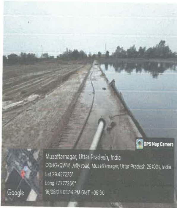
Operational Lagoon No. 1 (Cap. 14000 KLD)